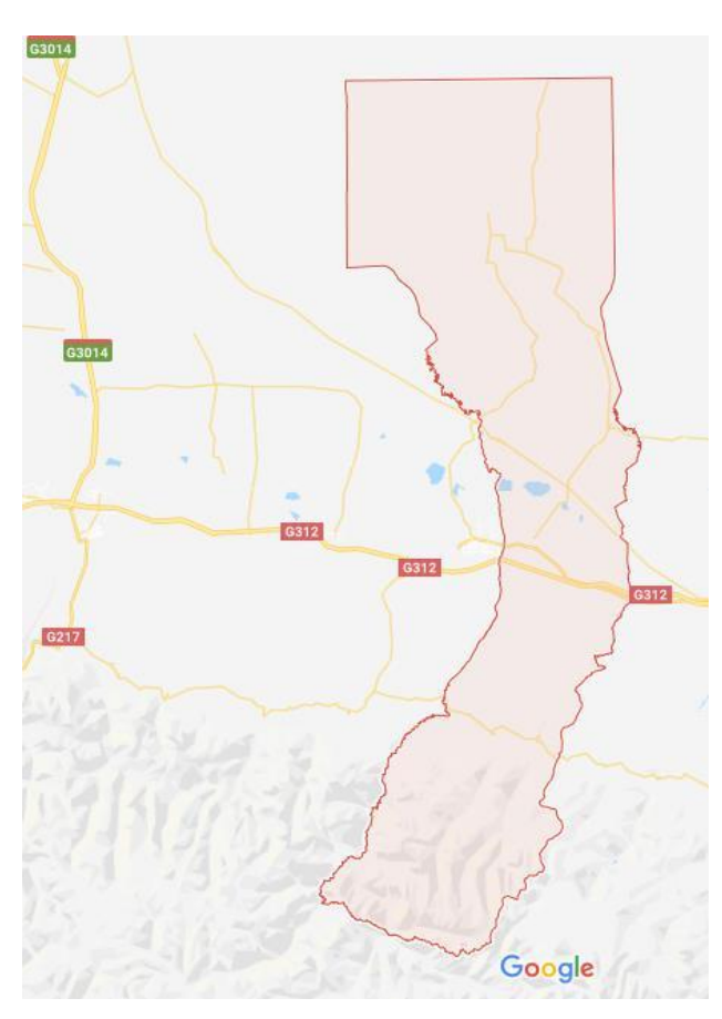
Figure 1. The location of Manas County

APPLIED ECOLOGY AND ENVIRONMENTAL RESEARCH 17(5):10509-10523. http://www.aloki.hu • ISSN 1589 1623 (Print) • ISSN 1785 0037 (Online) DOI: http://dx.doi.org/10.15666/aeer/1705_1050910523 © 2019, ALÖKI Kft., Budapest, Hungary