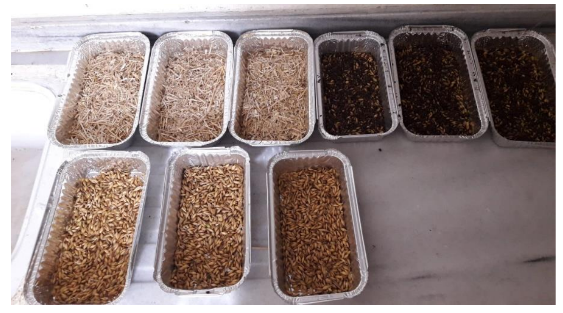
Figure 1. Barley germination patterns in hydroponics (top right: with dry olive pulp (PB); top left: with wheat straw (WB) and bottom: barley (Control; C))

to investigate the germination power and the effects of wheat straw and dry olive pulp on nutritional value of germinated barley. Wet weight of barley was used to determine the amount of seeds to be sown. Accordingly, 60 g of wet barley seeds were weighed into 0.017 m<sup>2</sup> trays and left for germination. The amount of seeds corresponded to 3550 g wet barley per m<sup>2</sup>, which was equivalent to 1000 g dry barley grain per m<sup>2</sup> ( Fig. 1 ).