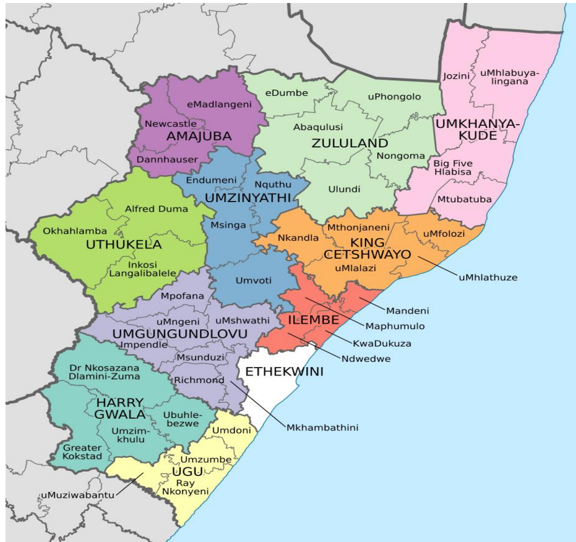
Map of the location of the study