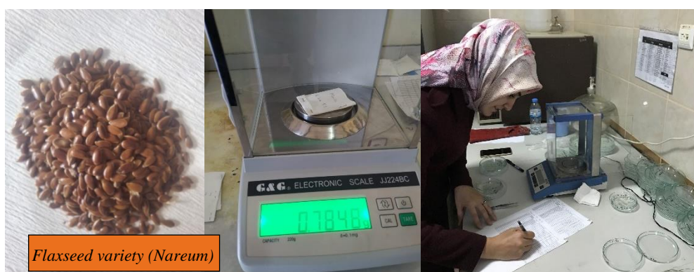
Figure 1. Flaxseed variety (Nareum) used in the experiment (date of supply 27.12.2019), and in the laboratory with climate cabinet, an oven, precision scales, etc., on the 15th day after placing, while seeds are measured for germination, radicle, plumule and seedling development

This research was carried out in the climate cabinet of Kahramanmaraş Sütçü İmam University, Faculty of Agriculture, Laboratory of Field Crops Department in March 2020. In the experiment, flaxseed variety (Nareum) seeds obtained from the Black Sea Agricultural Research Institute were used as material, and in the laboratory with climate cabinet, an oven, precision scales, etc., on the 15th day after placing, while seeds are measured for germination, radicle, plumule and seedling development ( Fig. 1 ).